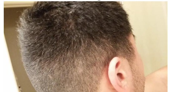
Cut Remaining Fades

Congratulations, you have your fade! Now that you're looking good, you can stop here or clean up the top portion of your hair (the longest hair length) by cutting it at a consistent length using your #5 hair clipper guard.